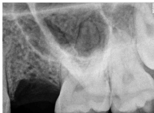
1. Site before surgery

When the bone of edentulous alveolar ridges located in the posterior sites of the maxilla is not sufficient, because of the proximity of the Sinus, an elevation of the membrane is required to create the suitable space to implant with a predictable rate of success. Due to less morbidity, some transcrestals procedures are recently increasing in usage among clinics. Nevertheless, not all of them are always predictable or are leading to the same regenerative results.