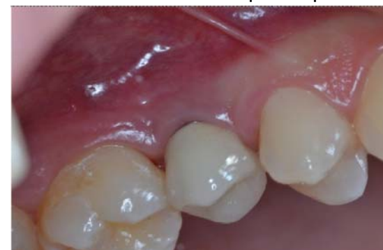
8. Clinical aspect after 5 years