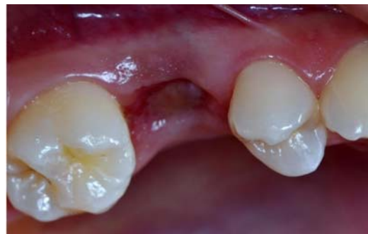
2. Clinical view of the site before surgery