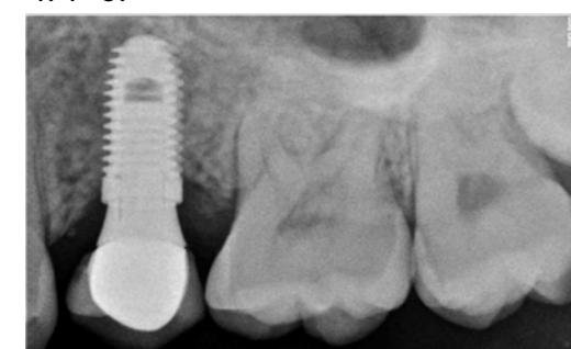
6. T= 3 years