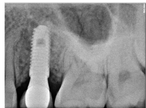
7. T = 5 years. Note the fixture surrounded by natural regenerated bone all around and beyond the apex.

Even if short implants are having an increasing success in Clinical practice, the possibility to regenerate the proper quantity of bone sufficient to insert at least a 10 mm fixture, must always be seriously considered by the Clinician. The MISE can provide high quality and quantity of bone in these situations. It is an easy technique, not so dependent by the Surgeon's ability, and which provides very good results when it is correctly performed, also with only a size of 2-3 mm residual bone crest.