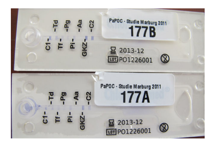
FIGURE 2 Picture of a test slide of CST

germ load confirms correct sampling and efficient bacterial lysis.